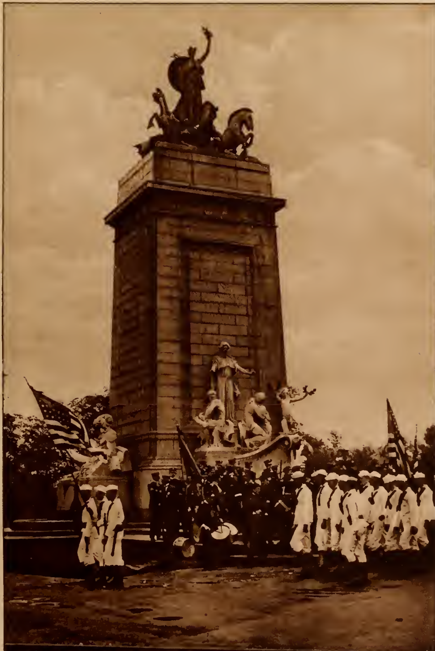
MAINE MONUMENT, marble structure at entrance to Central Park. Erected in 1913 to memory of heroes killed in explosion of Battleship "Maine" in Havana Harbor.